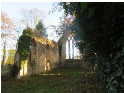
Tivetshall St Mary ruined church