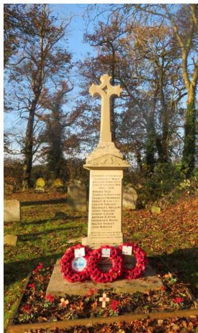
Tivetshall St Mary