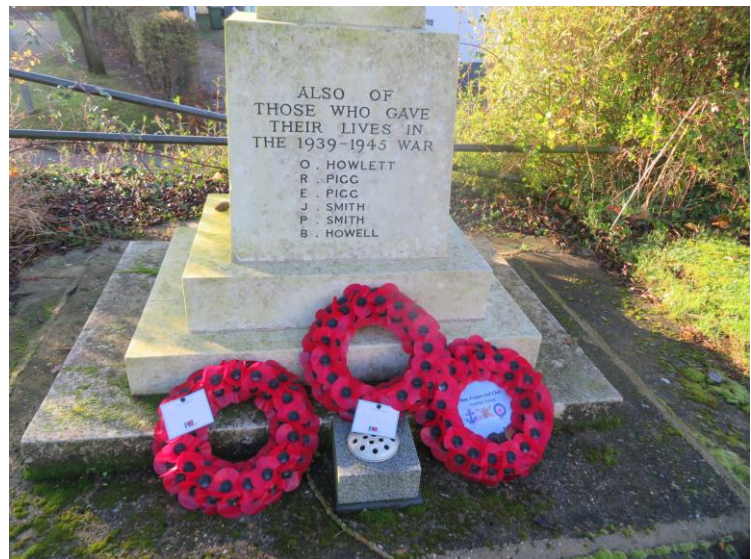
Pulham St Mary