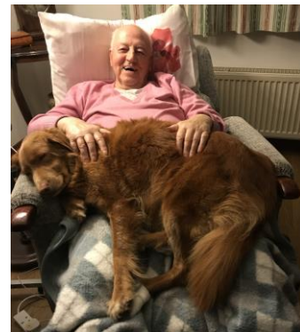
Nacho keeping Master company

'Butter wouldn't melt ...' Though actually it does, apparently!