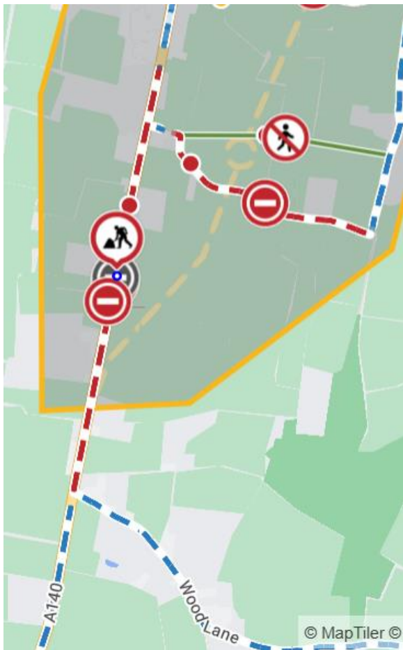
Long Stratton STRO11923 PT